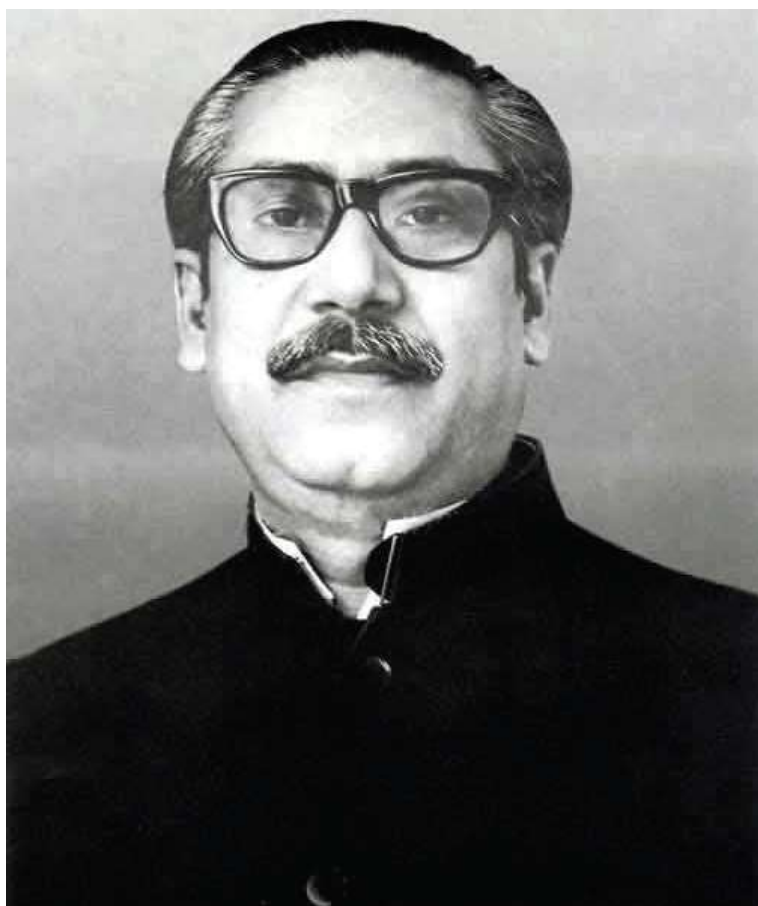
Father of the Nation Bangabandhu Sheikh Mujibur Rahman