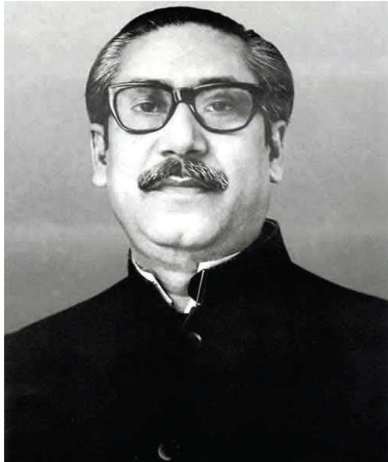
Father of the Nation Bangabandhu Sheikh Mujibur Rahman