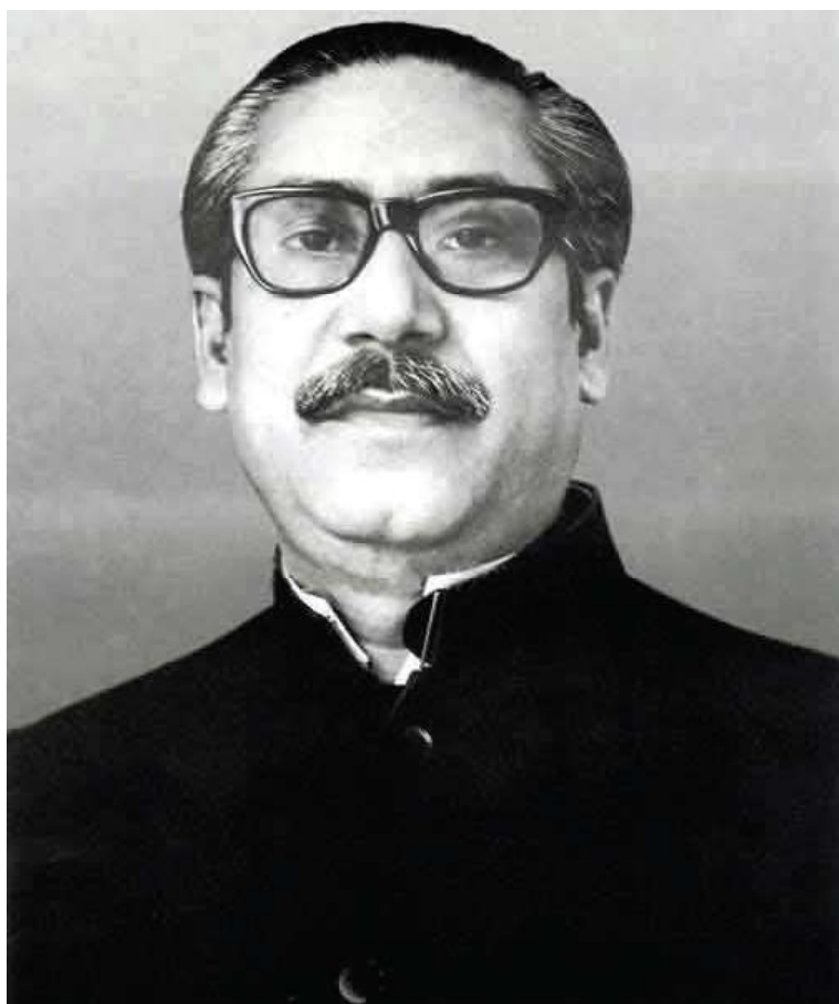
Father of the Nation Bangabandhu Sheikh Mujibur Rahman