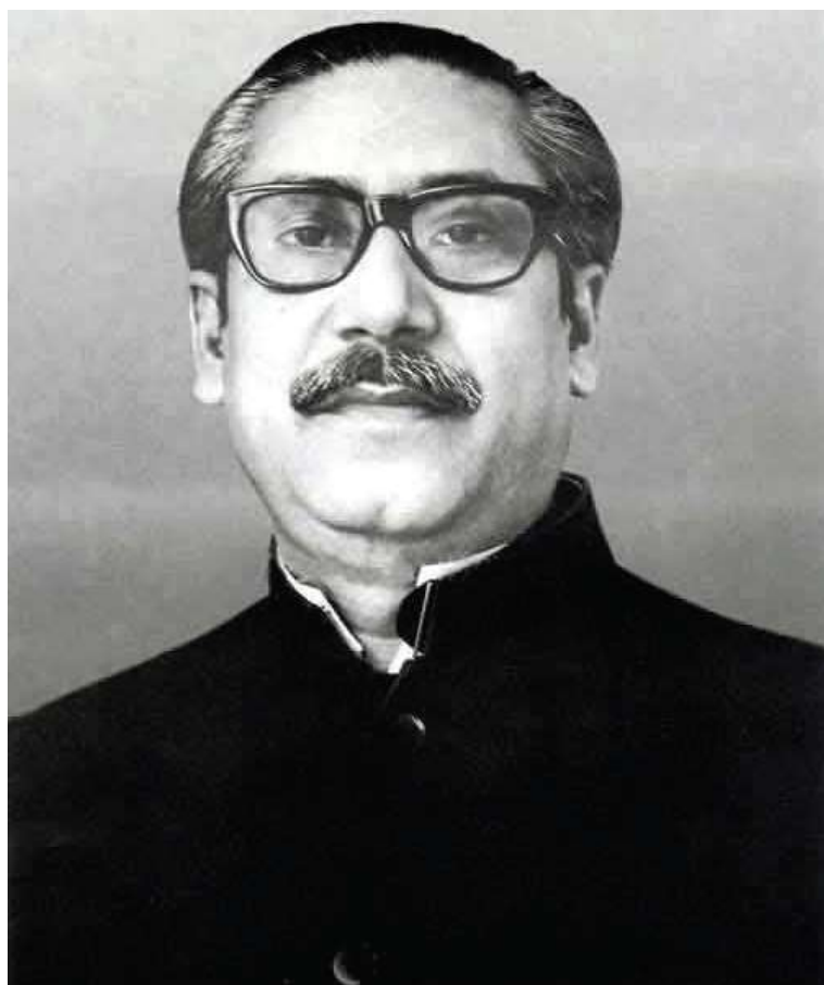
Father of the Nation Bangabandhu sheikh Mujibur Rahman